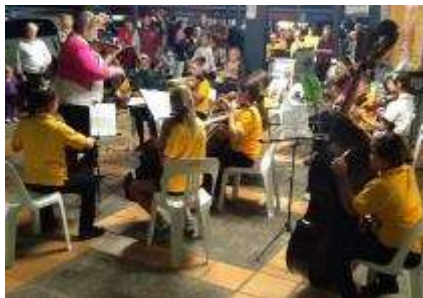
Our Concert Band

These days are an excellent opportunity for students to have intensive tuition and to work for several days with university and high school tutors as well as our Instrumental Music teachers. Please watch for this flyer.